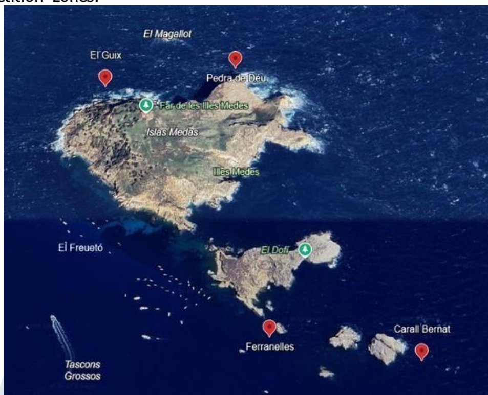
Diving spots in the Medes Island